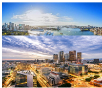
Los Angeles (USA)