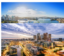
Los Angeles (USA)