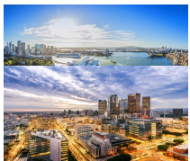
Los Angeles (USA)